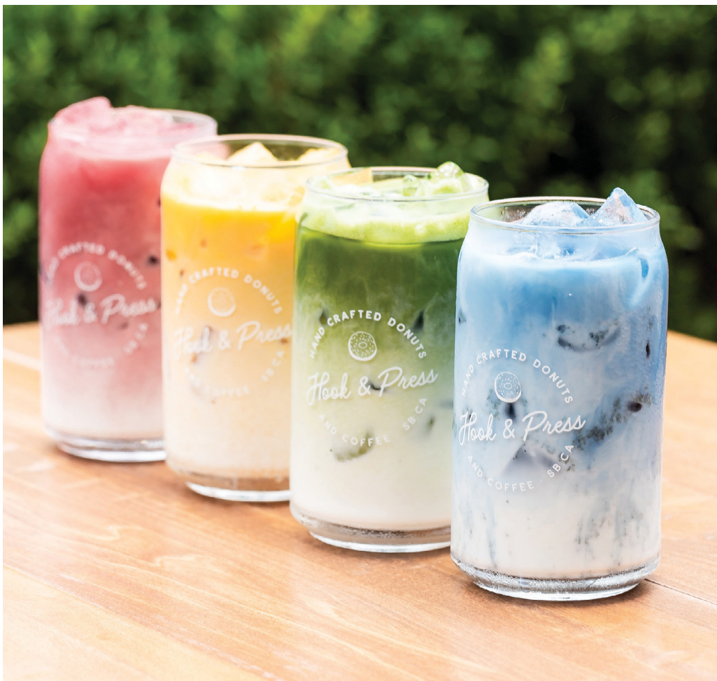
DOUGHNUT AND LATTES: DENISE SALINAS

Available hot or iced (perfect for summer), the blends are made with almond, coconut, or oat milk, and their colors come straight from the all-natural ingredients. Flavors include Rose Mylk Latte with rose, almond, and subtle beet notes that go perfectly with fruity doughnuts; Yerba Mate Latte, featuring a slightly grassy taste with a hint of cacao that pairs well with chocolate doughnuts; Matcha Latte, infused with green tea and citrus flavors; and Golden Mylk Latte, a mingling of warm spices that marries well with the cinnamon crumb browned-butter doughnut.